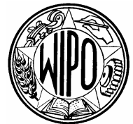
WORLD INTELLECTUAL PROPERTY ORGANIZATION