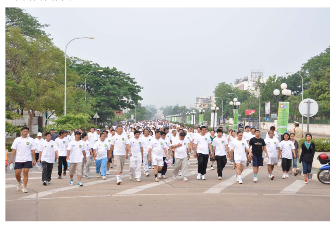
T-Flags were installed along the main Lanexang Avenue of Laos from the Monument to the Presidential Palace on the marathon course.

The event was officially opened by the Minister of National Science and Technology Authority (Prime Minister Office). Delegates from the public sector (line ministries), private enterprises, law students and local people of more than 700 people all participated in the celebration.