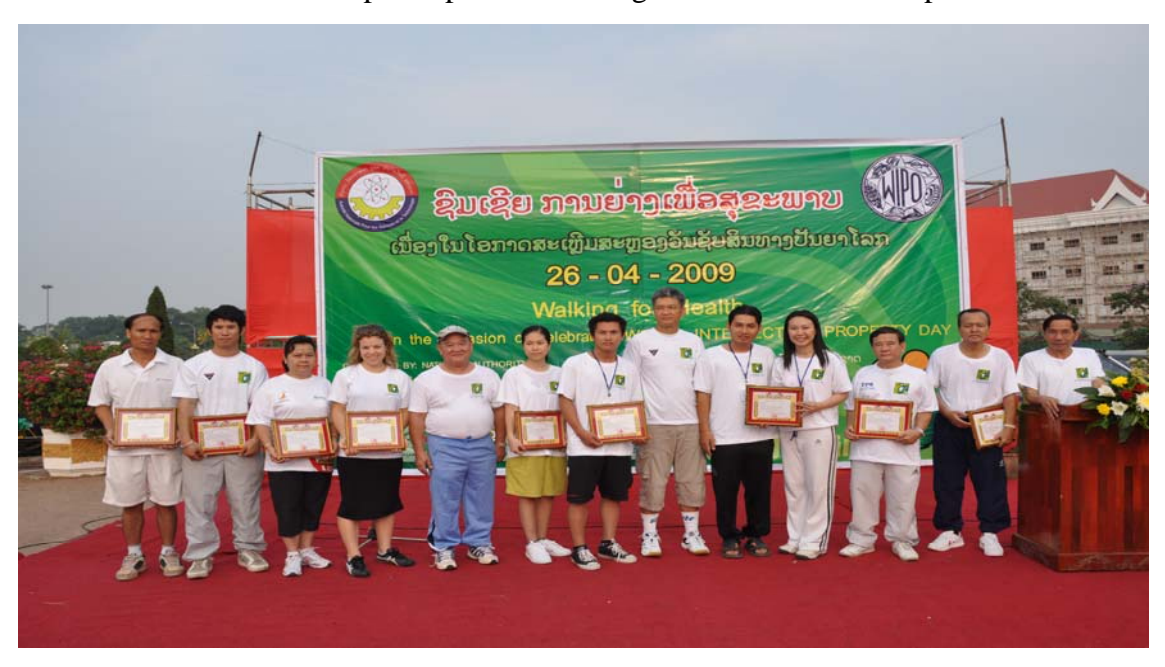
Minister of National Science and Technology Authority (Prime Minister Office) presented the Certificates of Appreciation to sponsors.

At the completion of the marathon, the Minister of National Science and Technology Authority (Prime Minister Office) awarded a certificate of appreciation to all sponsors and a raffle was drawn for participants to win a genuine Nokia mobile phone.