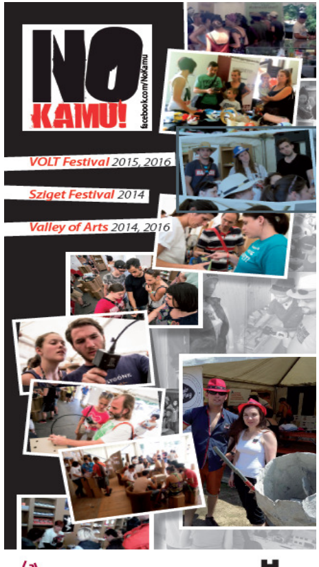
Hungarian Intelectual Property Office

Informative material on Intellectual Property (IP) and the effects and consequences of counterfeiting and piracy is on display supported by eye catching and sometimes shocking photos.