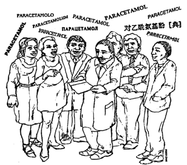
Fig. 2 One international name for one substance, example paracetamol.

Since then, the activities of national nomenclature commissions have been coordinated in order to achieve international standardization in nomenclature under the auspices of WHO according to article 2 (a) and 2 (u) of its constitution 3^3 :