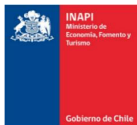
National Institute of Industrial Property (INAPI) (Chile)