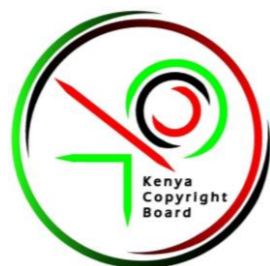
Kenya Copyright Board (KECOBO)