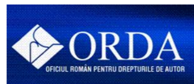
Romanian Copyright Office (ORDA)