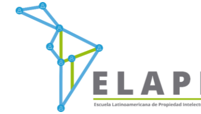
Latin American School of Intellectual Property (ELAPI)