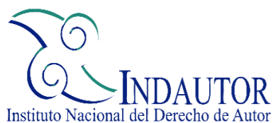
National Institute of Copyright (INDAUTOR) (Mexico)