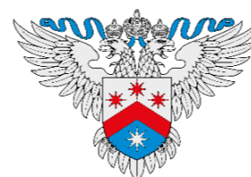
Federal Service for Intellectual Property of the Russian Federation (ROSPATENT)