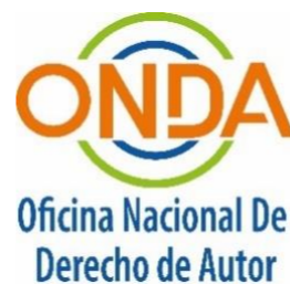
National Copyright Office (ONDA) (Dominican Republic)