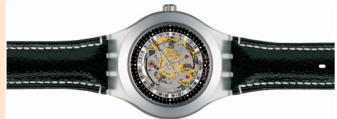
t̄m̄šR̄t̄b̄ t̄ t̄m̄qvP̄ G wR

w̄ei vU Ast̄Ki UvKv̄ ēq K̄ti Ges Āt̄bK t̄ tk w̄bēŪt̄bi gva t̄g Zv̄t̄ i wWRvB̄t̄bi I ci GK̄t̄P̄w̄Qv̄ Aw̄aKvi w̄b̄w̄Z̄ K̄ti |