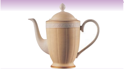
t m s R t b ` : w f t j i q + e P G . w R .